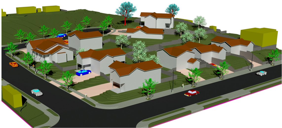
Overview Looking East