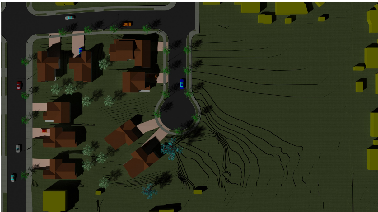
Conceptual Site Plan (For Illustrative Purposes only)