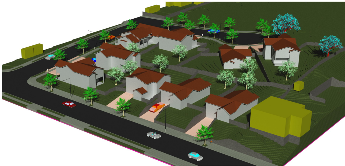
Overview Looking North