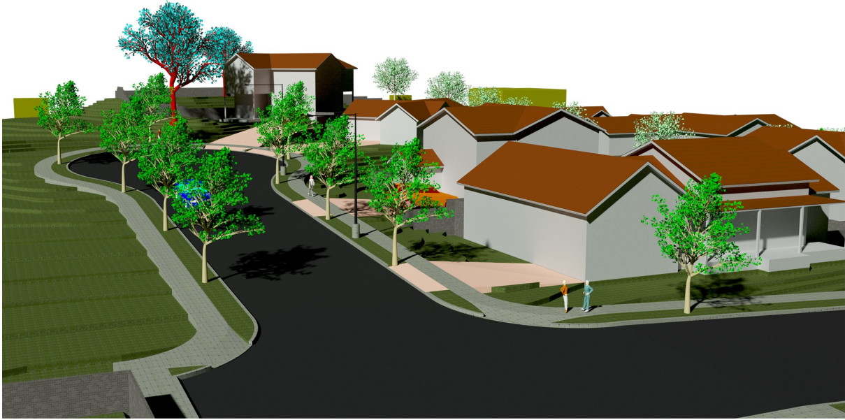
View of the Cul-de-Sac